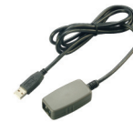
U1173A IR-to-USB cable